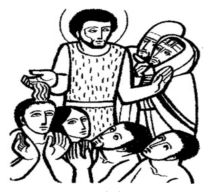
3 Domingo de Adviento B Misioneros Del Sagrado Corazón en el Perú