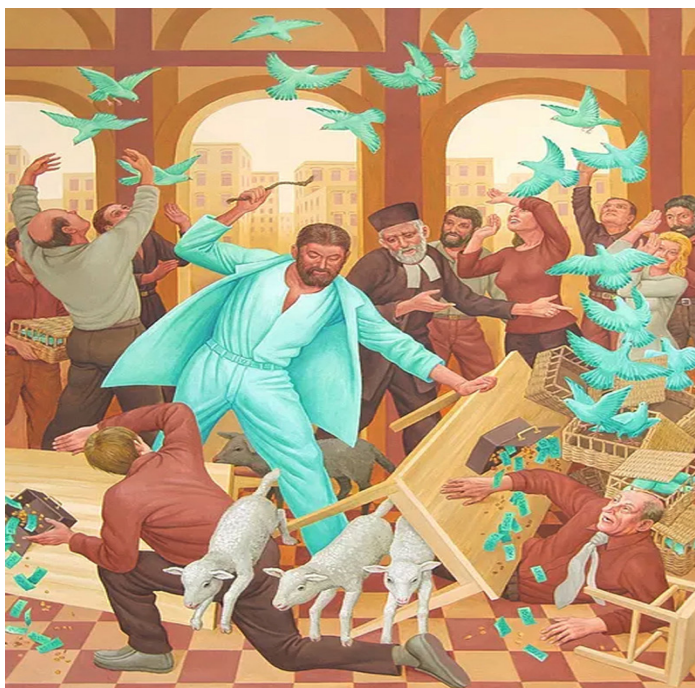
Christ Overturns the Tables of the Moneylenders Peter Koenig (2015)